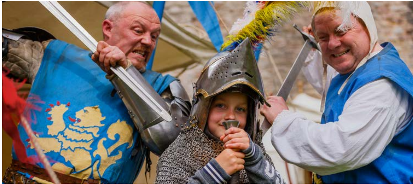
Knights at Chepstow Castle.

Monmouthshire County Council will also continue to work with partners such as Visit Wales and Southern Wales Tourism to support the industry to develop and create bookable experiences, and to find routes to market for their products. This includes collaborating with intermediaries to distribute products more broadly on our area's behalf; and working directly with tour operators and the trade market. Businesses will be encouraged to use low commission rate booking channels such as TXGB to reduce tourism leakage, and increase reach and bookability (e.g., to overseas operators via the Visit Britain eShop). The potential for growing the corporate market in collaboration with ICC Wales, Cardiff Capital Region and Visit Wales will also be explored.