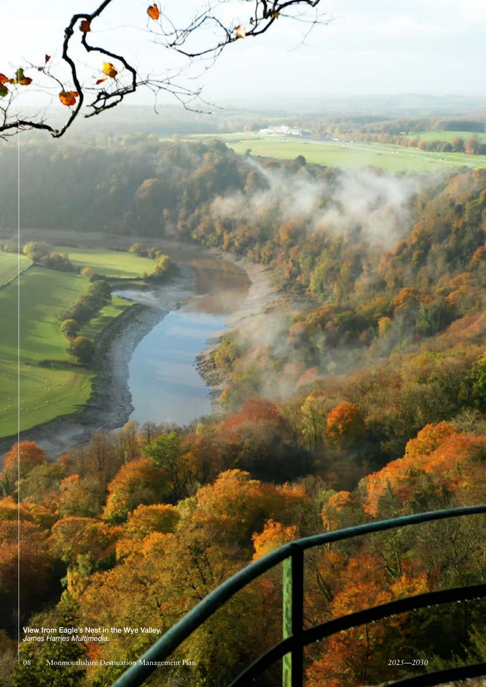
View from Eagle's Nest in the Wye Valley.